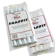
PC8 Pipe Cover